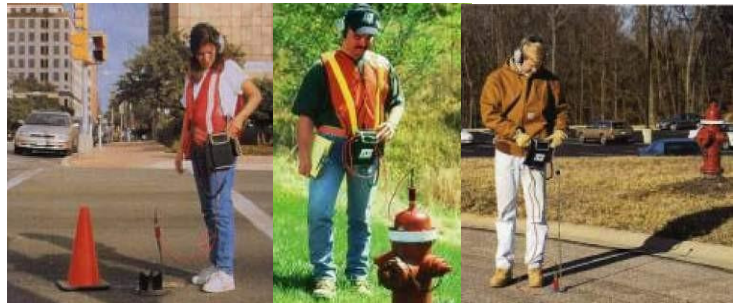
Downtown leak survey on main line valve

A leaking pipe produces a distinct noise that travels along the pipe, through the water and sometimes to the surface. An operator using the S30 can listen at various contact points (valves, hydrants etc) to determine whether or not the pipe is leaking. To do this, the operator places the AX80 sensor in contact with any access point in the distribution system. When the S30 is turned on, the console amplifies the sound so that the user can hear the noise through the supplied aviator quality headphones. The analog meter gives an indication of the noise intensity in the pipe and, by listening at several points in a given area, an operator can localize the general location of a leak.